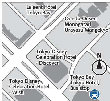
[Tokyo Bay Tokyu Hotel] Bus stop

※Reservation is not accepted from Shin-Urayasu Station to Narita Airport.